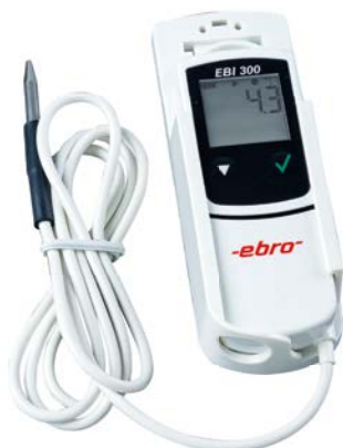
EBI 300 TE + EBI 300 WM2