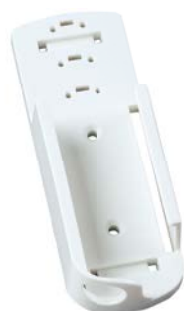
EBI 300-WM2 Wall Mount for EBI 300 / 310